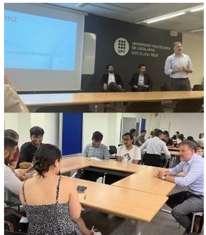
Photo: BNZ educational chat with students in UPC university

Additionally, BNZ provides training for employees on managing and mitigating environmental risks and raise awareness about environmental, climate change and energy consumption issues.